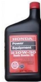
Engine Oil - Figure #8

5. To provide water to the CaviBlaster® 0520-G power unit, connect garden hose to the water inlet connection on the power unit (Figure-9).