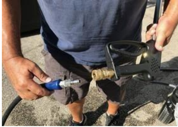
Connecting the gun to the High Pressure Hose - Figure #15

5. Connect the gun to the high-pressure hose (Figure-15) and submerge the gun in water.