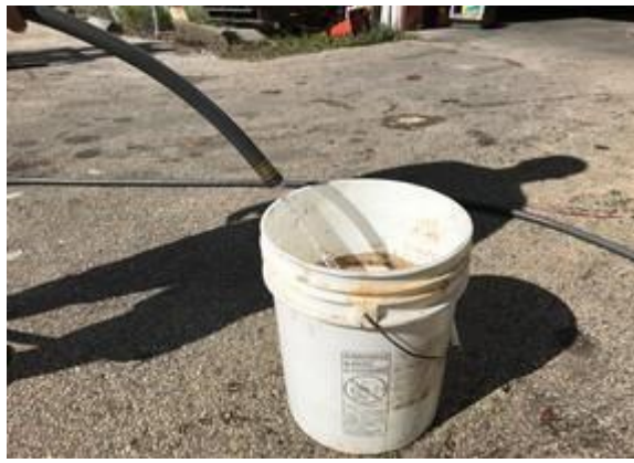
Fill up a 5 gallon bucket in less than one minute - Figure #10