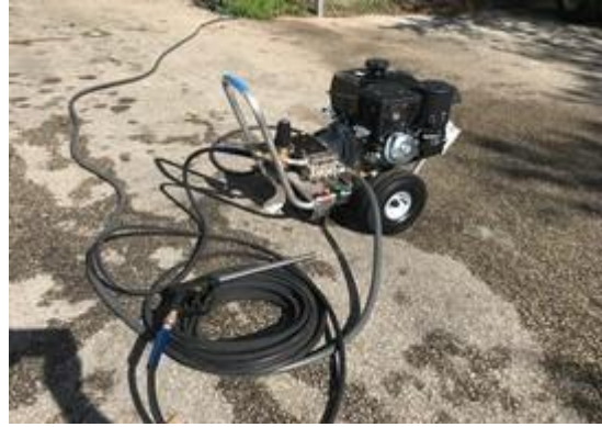
Overall system set up - Figure #17