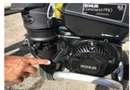
Recoil Assembly - Figure #14