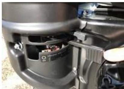
Throttle at the On position - Figure #12