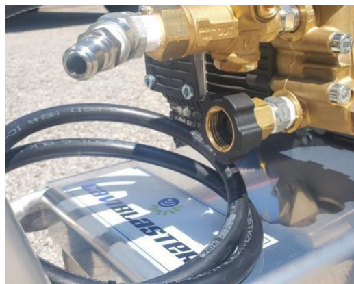
Connect Garden Hose to Water Inlet - Figure #9

5. To provide water to the CaviBlaster® 0520-G power unit, connect garden hose to the water inlet connection on the power unit (Figure-9).