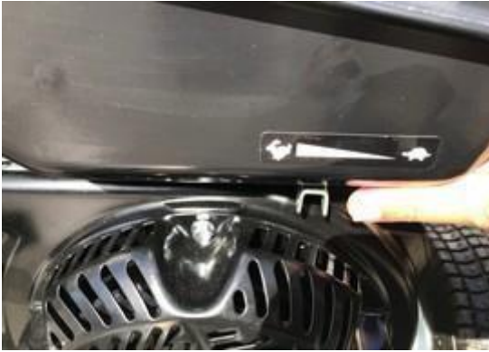
Throttle to Max position - Figure #16

9. Once the unit is running and warm, move the throttle to Max. (figure 16) The system is now ready to operate. (figure 17)