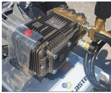
Pump Oil Red Cap - Figure #5