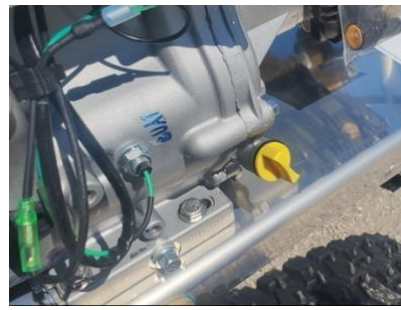
Yellow Cap on head cover - Figure #6

NOTE: Pressure Pump Oil (SAE 30W-Non-Detergent) Figure-7; Engine Oil (SAE 10W 30) Figure-8