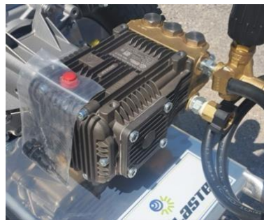
Pump Oil Level - Figure #3