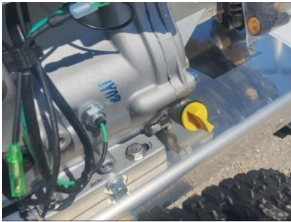
Engine Oil Level - Figure #2