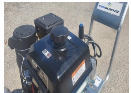
Fuel Level - Figure #4