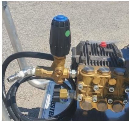
Pressure Regulator Knob - Figure #19