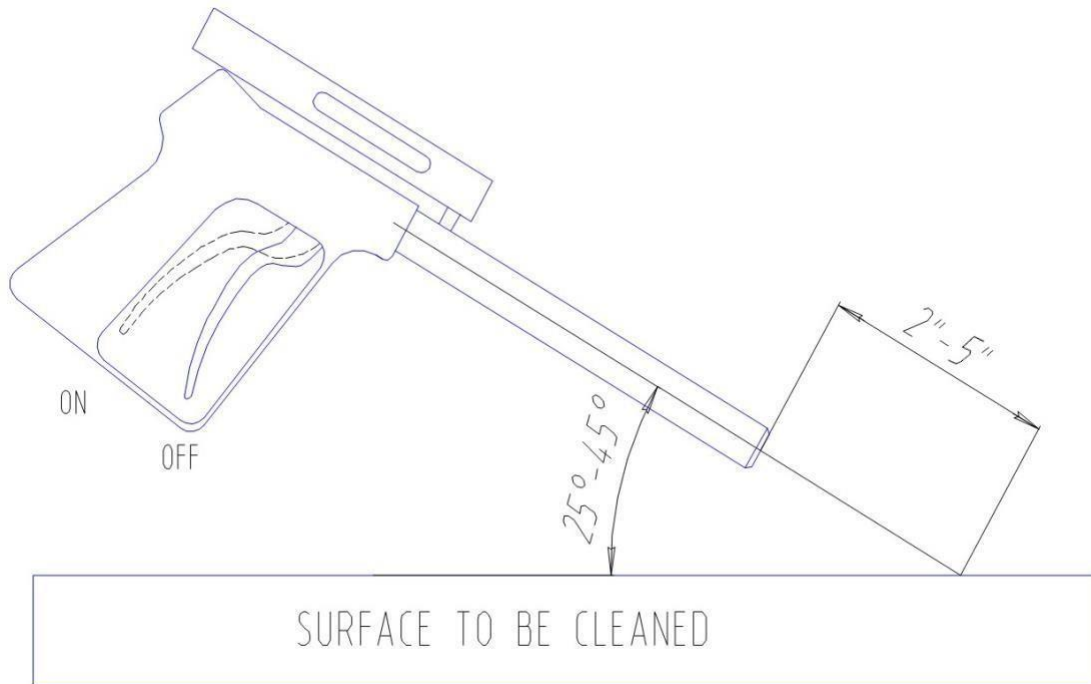
Gun efficient operating technique - Figure #18

Ensure that the power unit operator and other people working in the vicinity of the power unit wear appropriate hearing protection when the engine is running.