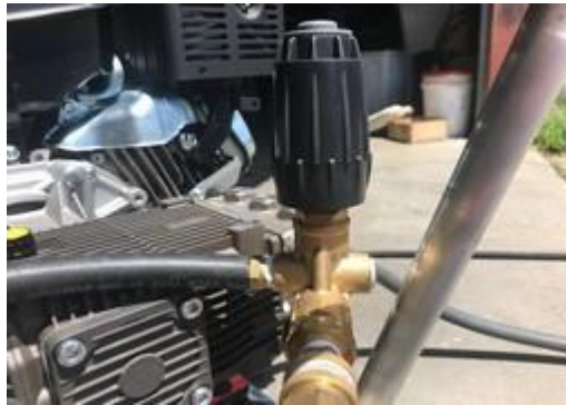
Pressure Regulator Knob - Figure #19