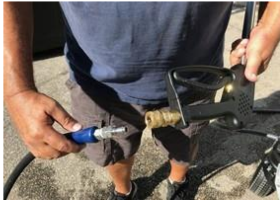
Connecting the gun to the High Pressure Hose - Figure #15

5. Connect the gun to the high-pressure hose (Figure-15) and submerge the gun in water.