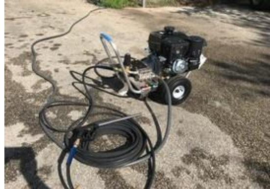
Overall system set up - Figure #17