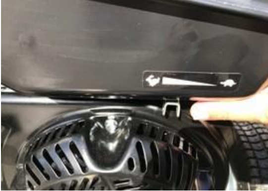
Throttle to Max position - Figure #16

The system is now ready to operate. (figure 17)