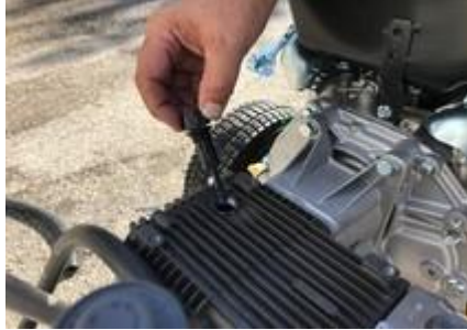
Fuel Level - Figure #4