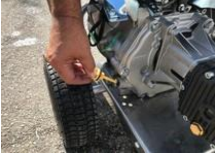
Engine Oil Level - Figure #2 Pump Oil Level - Figure #3

3. Check lubricating oil(s) and fuel levels: Assure proper oil level in engine crankcase, pressure pump and fuel level in fuel tank (gasoline). Figures 2, 3, 4.