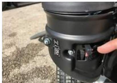
Fully engage Choke - Figure #13