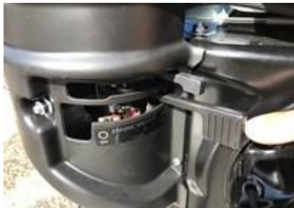
Throttle at the On position - Figure #12