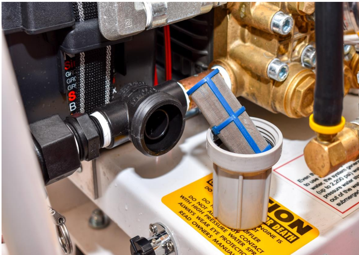
Water Inlet - Figure #1