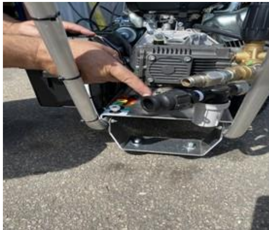
Connect Feed Pump to Water Inlet - Figure #10

Inspect inlet connection (Figure-10) to ensure that it is not clogged. Clean if necessary