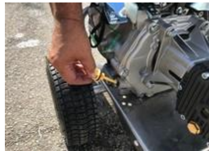
Yellow Cap on head cover - Figure #6

NOTE: Pressure Pump Oil (SAE 30W-Non-Detergent) Figure-7; Engine Oil (SAE 10W 30) Figure-8