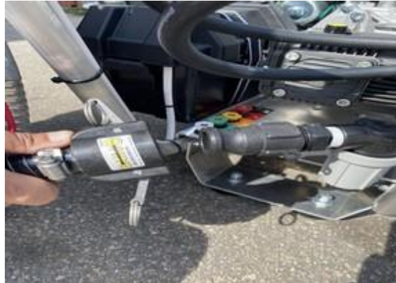
Connect Feed Pump to Water Inlet - Figure #9

5. To provide water to the Model 0625-G CaviBlaster® power unit, connect feed pump to the water inlet connection on the power unit (Figure-9).