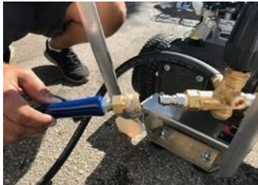
Connect HP Hose to the quick connect under pressure regulator - Figure #11