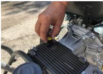
Pump Oil Yellow Cap - Figure #5

4. Fill lubricating oil(s) to proper level(s) in the pressure pump (Yellow cap on pump) (Figure-5) and engine (Yellow cap on head cover) (Figure-6) per manufacturers' operating manuals.