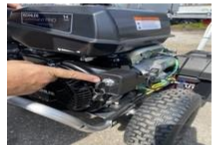
Ignition key - Figure #14