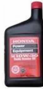
Engine Oil - Figure #8